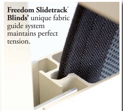
Freedom Slidetrack® Blinds' unique fabric guide system maintains perfect tension.