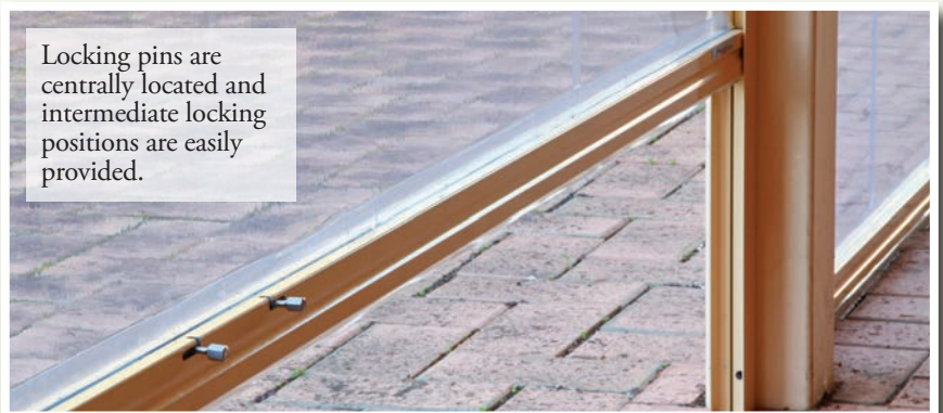
Locking pins are centrally located and intermediate locking positions are easily provided.